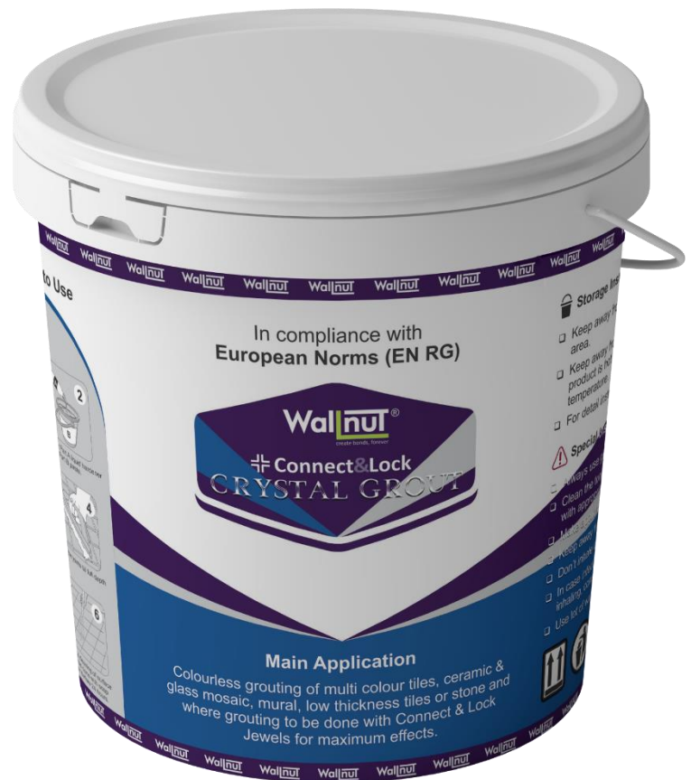
Single Mono Pack